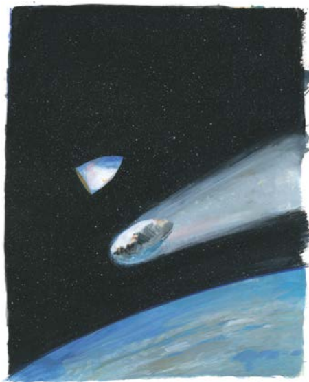
Jame's Prunier, original illustration for Around the Moon (éditions Gallimard)