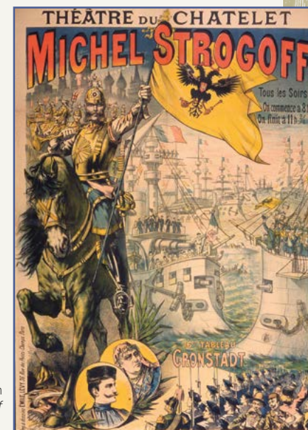
Poster for the stage adaptation of Michel Strogoff

Jules Verne wrote over thirty plays in total, yet this aspect of his writing is not well known. In fact, he found theatrical success by adapting his novels Around the World in Eighty Days , Michel Strogoff , and In Search of the Castaways for the stage. These spectacular productions, with their dazzling sets and staging, paved the way for film adaptations in the following century.