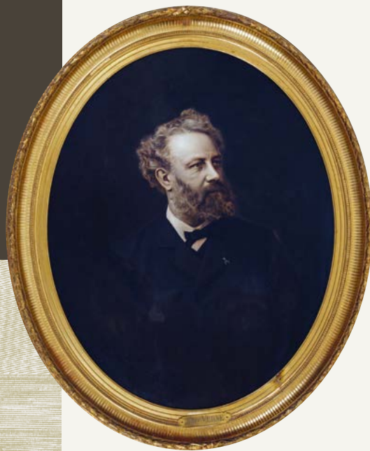
Portrait of Jules Verne, oil on canvas