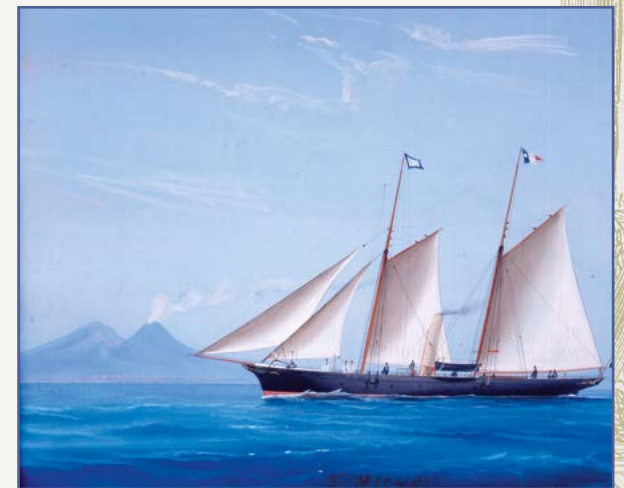
Saint-Michel III in the Bay of Naples, gouache

The sea was his main source of inspiration. From 1866, he combined writing and maritime travel. His trips aboard his own vessels, the three Saint-Michels , truly stimulated his imagination. Twenty Thousand Leagues under the Sea was partly written in the small cabin of Saint-Michel I .